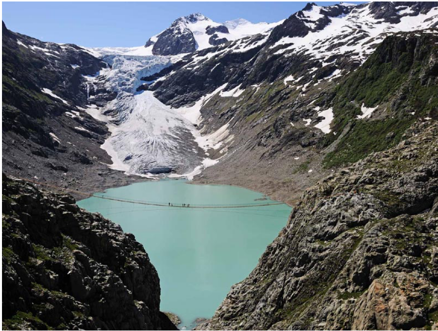
The Trift Suspension Bridge

I read Damnation when I was recently in Switzerland, a country I know well. And the book represents quite perfectly the raison d'être of TripFiction. An extremely good read with a very firm sense of location. Apart from Interlaken and the Bernese Oberland, Bern and Zurich are strong characters, as is a beautiful restaurant high above Lake Geneva. You can absolutely sense the country you are in. For me, the events that took place on the Trift Glacier suspension bridge were particularly evocative. I do not have a head for heights and my legs turned to jelly just reading Beck's text... I have seen the bridge from afar, and that is quite close enough for me!